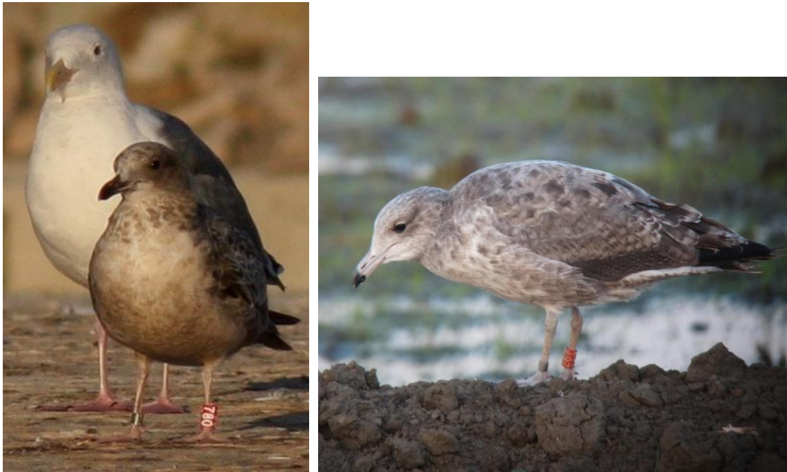
Fig. 6. Color-banded Mono Lake gulls detected away from breeding grounds in 2013. Left: a juvenile at Southeast Farallon Island, San Francisco County 04 Sept. with Western Gull ( L. occidentalis ) behind. Right: a second-year bird at the Yolo Bypass Wildlife Area Yolo County 19 Aug.

Field observations of color-banded Mono Lake gulls generated 15 reports ranging from Lincoln County, Oregon in the north to San Luis Obispo County, California, in the south. The later was a red banded juvenile observed August 7; the earliest coastal record of a color-banded Mono Lake juvenile thus far. Of the color-band observations, over 25% (7) were from Southeast Farallon Island, located 48 km (30 mi.) off San Francisco during fall migration. In 2009, up to 16 color-banded juveniles from Mono Lake (about 3% of the successfully fledged, banded chicks that year) were observed on SE Farallon during a 2 week period (Nelson and Greiner 2009), suggesting this may be an important region utilized by migrant Mono Lake gulls some years. Two 3-year olds identified by their red coded color bands were observed within the Mono Lake colony and may have been nesting or prospecting. Most California Gulls do not breed until their 4 th year, but some (typically males) will breed in their third year (Winkler 1996).