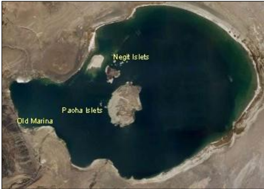
Fig. 1. Location of gull nesting islets within Mono Lake.

The winter of 2012-2013 was relatively dry for the Mono Basin. Snowpack levels measured at Gem pass were 70% of average as of April 1 2013, marking the second consecutive dry winter in the Mono Basin. Mono Lake dropped 0.6 m (1.9') from May 2012 to May 2013. According to data compiled from a Lee Vining weather station present since 1988, the summer of 2013 was relatively warm and wet. Average temperatures for June were the warmest on record, and the .05 m (2 inches) of rain that fell in July was the most recorded locally since 2002 (Greg Reis, Mono Lake Committee). By July 2013, despite the slight increase due to rain, the lake level dropped to 1945.1 m (6381.7') - the lowest recorded during the gull breeding season since 2004 (data courtesy of Los Angeles Dept. of Water and Power website). In both 2004 and 2013 Coyote ( Canis latrans ) predation occurred on nesting islands due to reduced water channels protecting the islets.