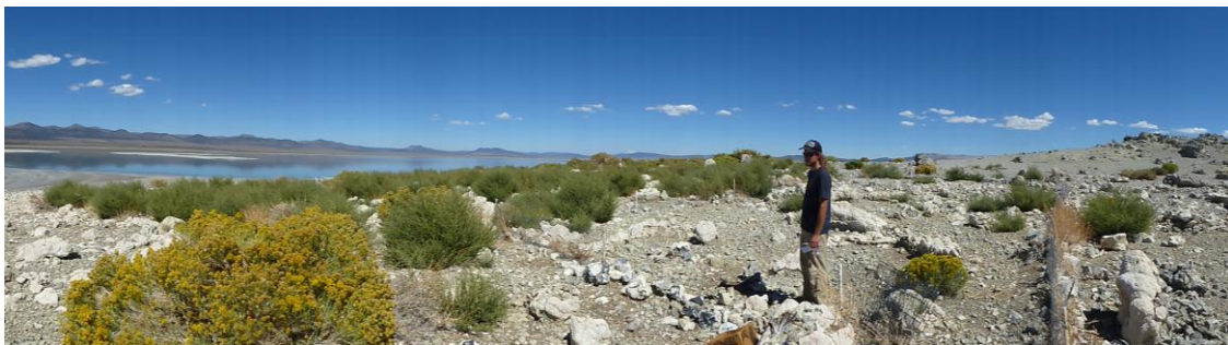
Fig. 5. Twain West Plot on 20 Sept. 2013 showing Bassia growth to its north ( Chyrsothamnus in foreground)

Old Marina Islet was also raided by a Coyote and responsible for the demise of many chicks, and apparently, adults as well. On the evening of July 31, 2013 Mono Lake volunteer Susan Weddel observed a Coyote cross a small water channel separating Old Marina Islet (Fig. 1) from the mainland. It was observed making two trips onto the islet creating a huge chaos, and observed killing many chicks. Many additional chicks were “force fledged” as they dispersed into the water to escape from the Coyote. On Aug. 2, KNN observed several unflighted live chicks or juveniles plus a dead chick along the mainland shoreline adjacent to Old Marina; of these 3 were obviously injured. Only about 5 chicks or flighted juveniles remained on the islet (one of which was obviously injured), and all adults had abandoned. Four dead adults were visible with binoculars, though much of the islet surface was obstructed from view. Although this event occurred toward the end of the breeding season, it was apparent many nests and chicks were affected.