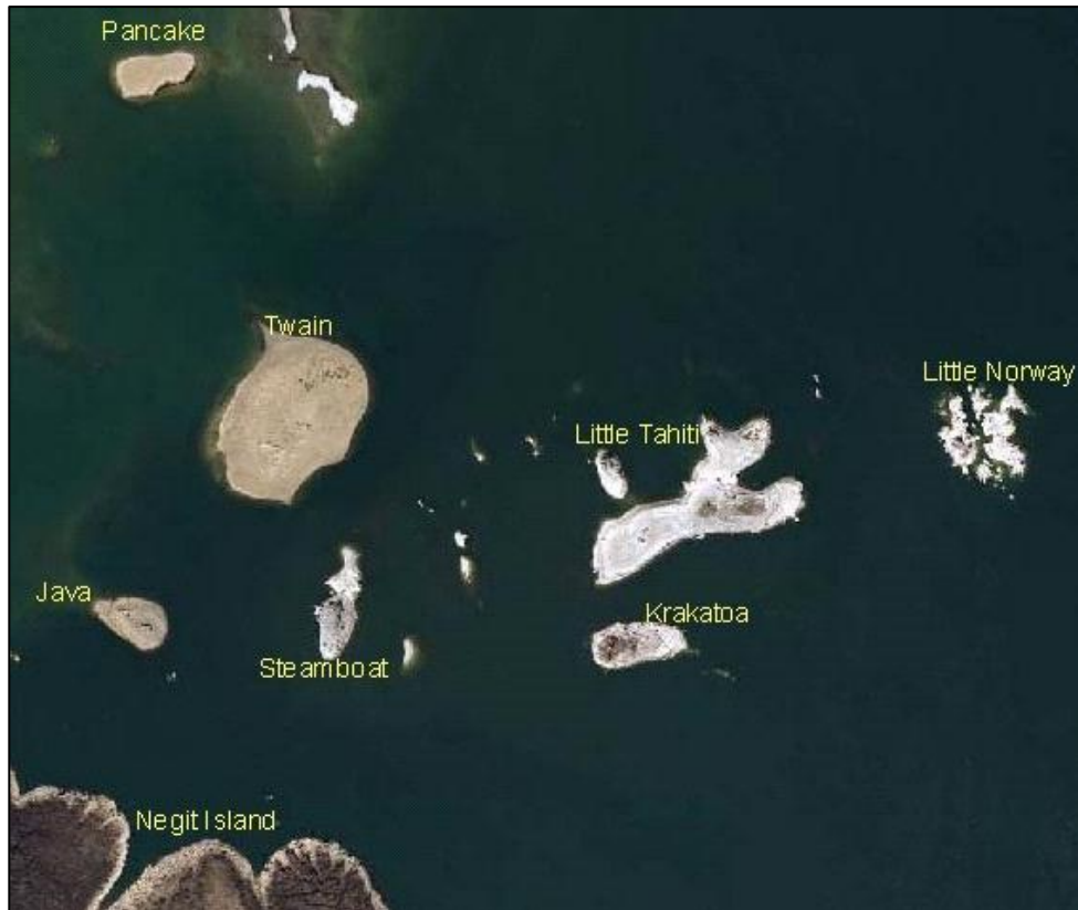
Fig. 2. View of individual islets within the Negit Islet complex.

nest density. Every nest was counted with a tally meter and marked with a small dab of water-soluble paint to avoid duplicate counts. For some small islets, incubating adults were counted from a small motor boat.