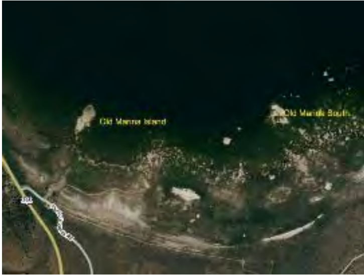
Figure 2. West shore of Mono Lake showing Old Marina and Old Marina South islands