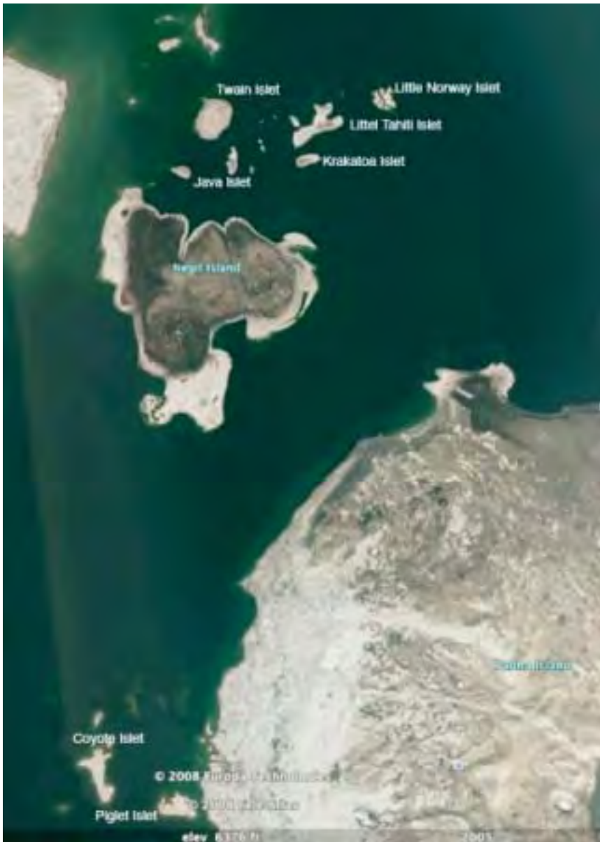
Figure 1. Map of study area showing the Negit and Paoha islets.